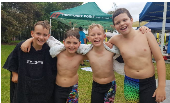
Jnr Boys Relay Team