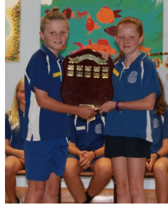
Winning House Wahoo