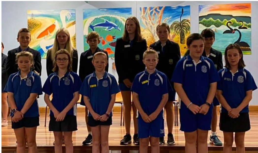
School Leaders 2021 Front Row – Sports Captains Back Row – Captains/Vice/Prefects