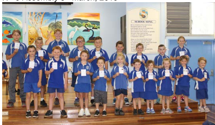
Class Award Recipients