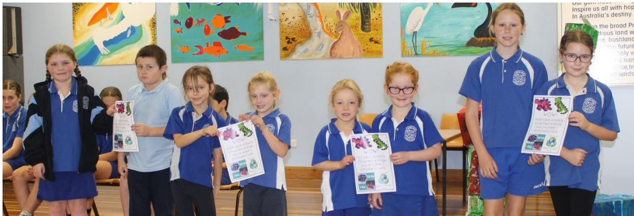
Lids for Kids Certificates