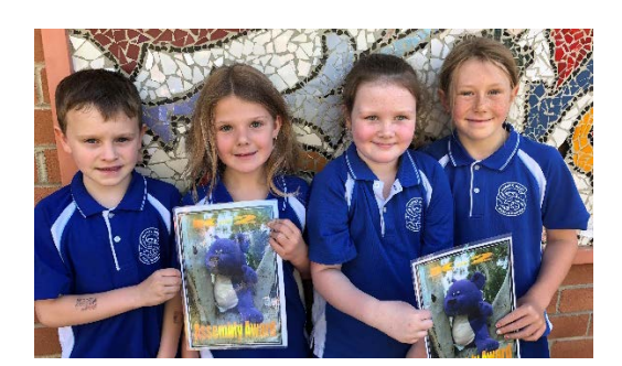
1M and 2N shone again and were awarded with the assembly award.