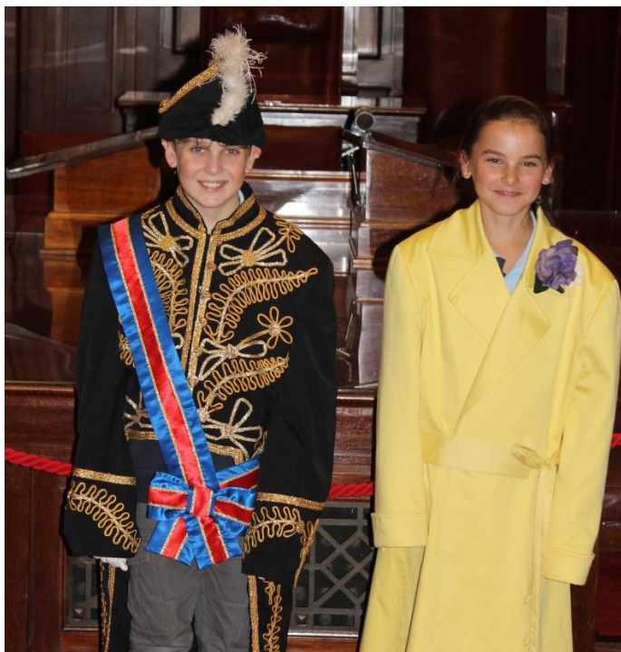
Canberra Excursion 23 - 25 May, 2017